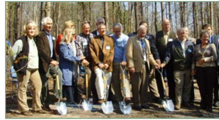
Groundbreaking at the Sylvan Heights Waterfowl Park May 2009