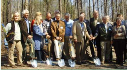
Groundbreaking at the Sylvan Heights Waterfowl Park May 2009