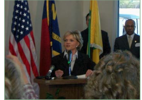
Gov. Beverly Perdue visited Halifax County to announce the Reser's expansion.

grocery chain stores, club stores, commissaries, convenience stores and