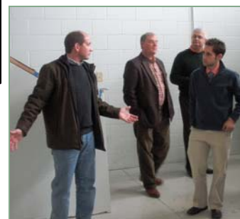
NEED—Northeast Economic Developers Planning Meeting Feb 2010

Center for Automotive Research and viewed the progress since the near completion of the Phase IA construction. The test track is now paved and the facility is open for business. Self-sufficient maintenance bays are available for lease to companies involved in vehicular testing, and recruitment efforts are underway. Driver training events sponsored by car clubs