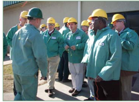
Committee of 1000 members tour Nucor Steel's manufacturing plant in Hertford County.

At the quarterly meeting in July 2009, the group toured Avoca, Inc, a commercial botanical extraction company located in Merry Hill, NC. The next Committee of 1000 meeting will be April 9, 2010 at the Commission office in Edenton. Any businesses interested in regional economic development are welcome to join. The Committee of 1000 also sponsors the Northeast State of the Region event scheduled for February 26th in Williamston. The public is